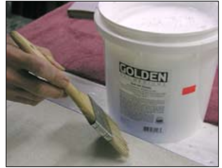
applying the gel soft medium