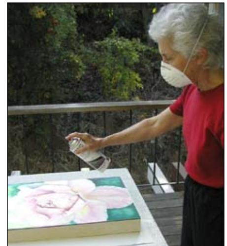
spraying the varnish