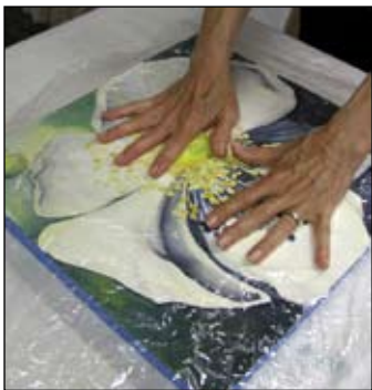
pressing out air bubbles