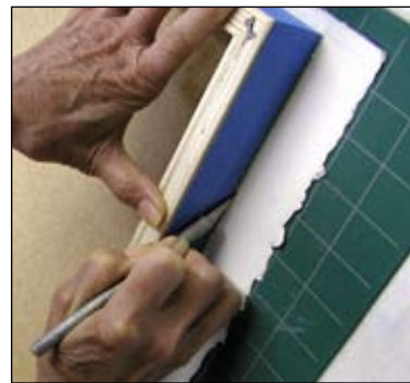
trimming edges with Xacto