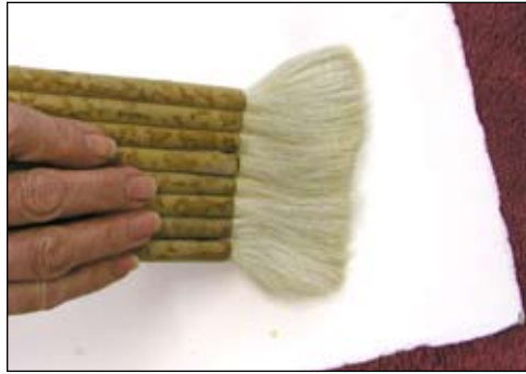
wetting the back of the painting